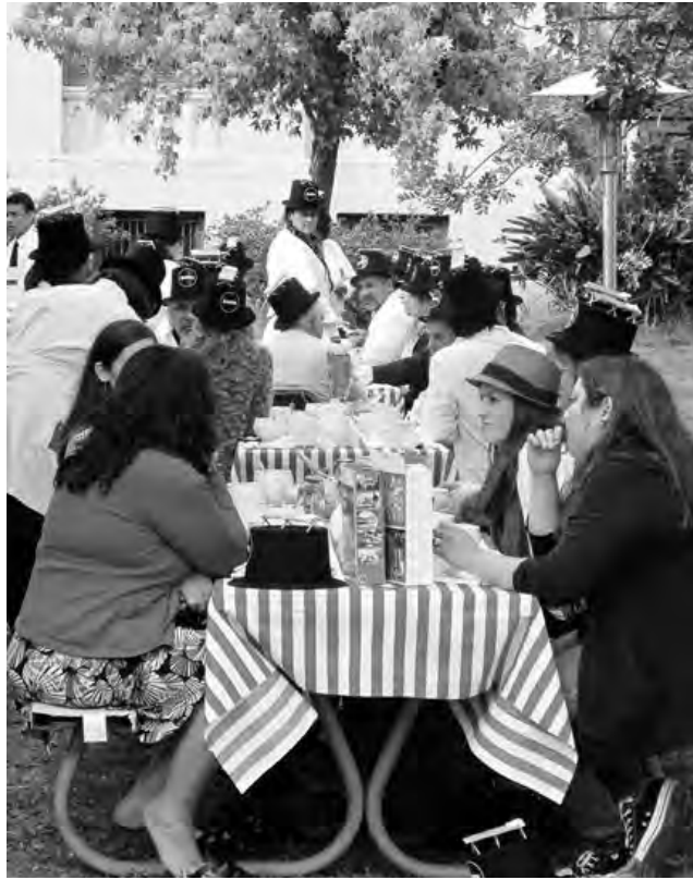
Image No. 10 Date: 2010